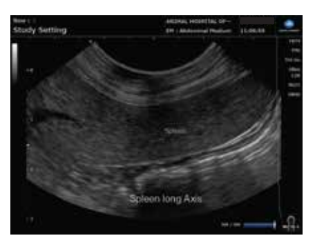
Spleen long Axis