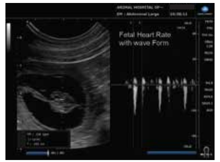
Fetal Heart Rate with wave Form