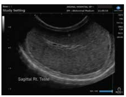
Sagittal Rt. Teste