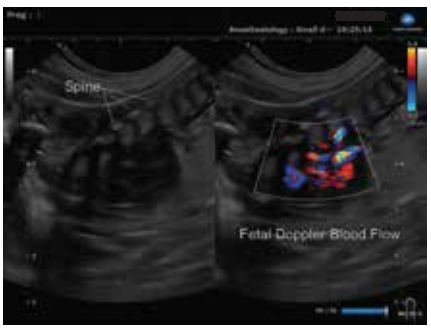
Fetal Doppler Blood Flow